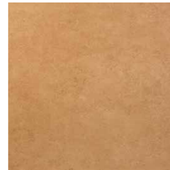
DBCD Damasco Ocre 45 S 45x45 cm.