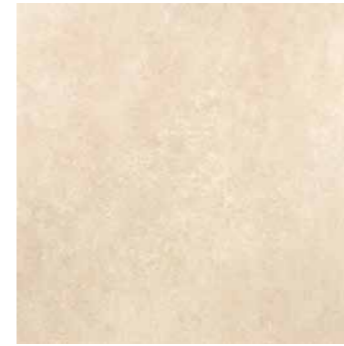
DBCC Damasco Beige 45 S 45x45 cm.