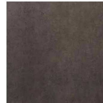
DBCF Damasco Antracita 45 S 45x45 cm.