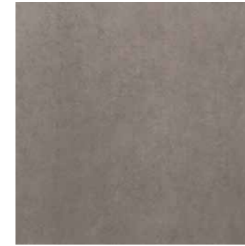
DBCE Damasco Gris 45 S 45x45 cm.