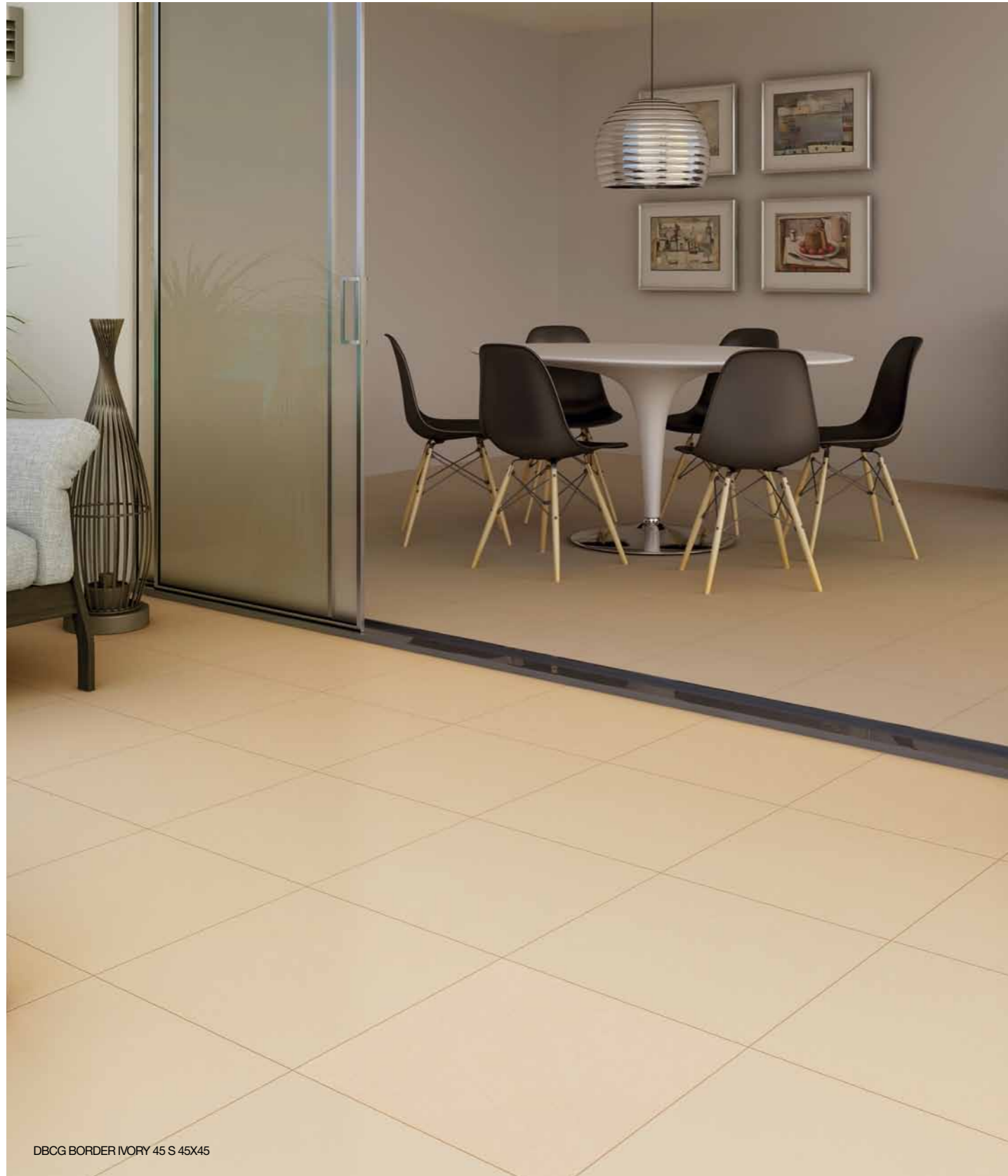
DBCG BORDER IVORY 45 S 45X45

Conforme/According to/Conforme Gemäß/Conforme/ Соответствует Bla / UNE EN 14411 G