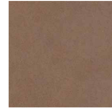
DBCJ Border Brown 45 S 45x45 cm. DBCP Border Brown 45 Grip 45x45 cm.