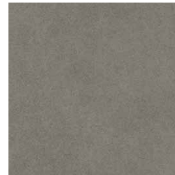
DBCI Border Grey 45 S 45x45 cm. DBCN Border Grey 45 Grip 45x45 cm.