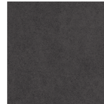
DBCK Border Black 45 S 45x45 cm. DBCQ Border Black 45 Grip 45x45 cm.