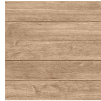
DBGV Boise Haya 45 S 45x45 cm.