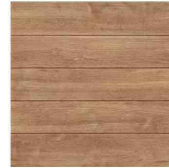
DBGU Boise Roble 45 S 45x45 cm.