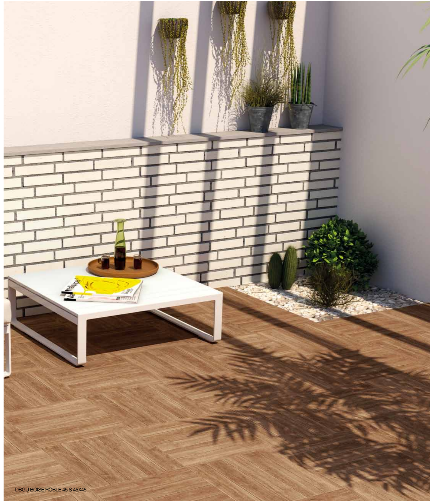
DBGU BOISE ROBLE 45 S 45X45

Conforme/According to/Conforme Gemäß/Conforme/ Соответствует Bla / UNE EN 14411 G