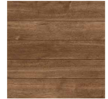
DBGT Boise Nogal 45 S 45x45 cm.