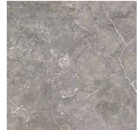
DBMB Rt-Perseo Grey Lap 60x60 cm.