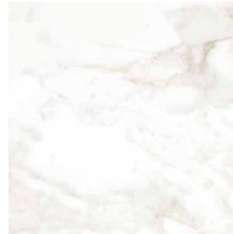
DBMA Rt-Perseo Caldia Lap 60x60 cm.