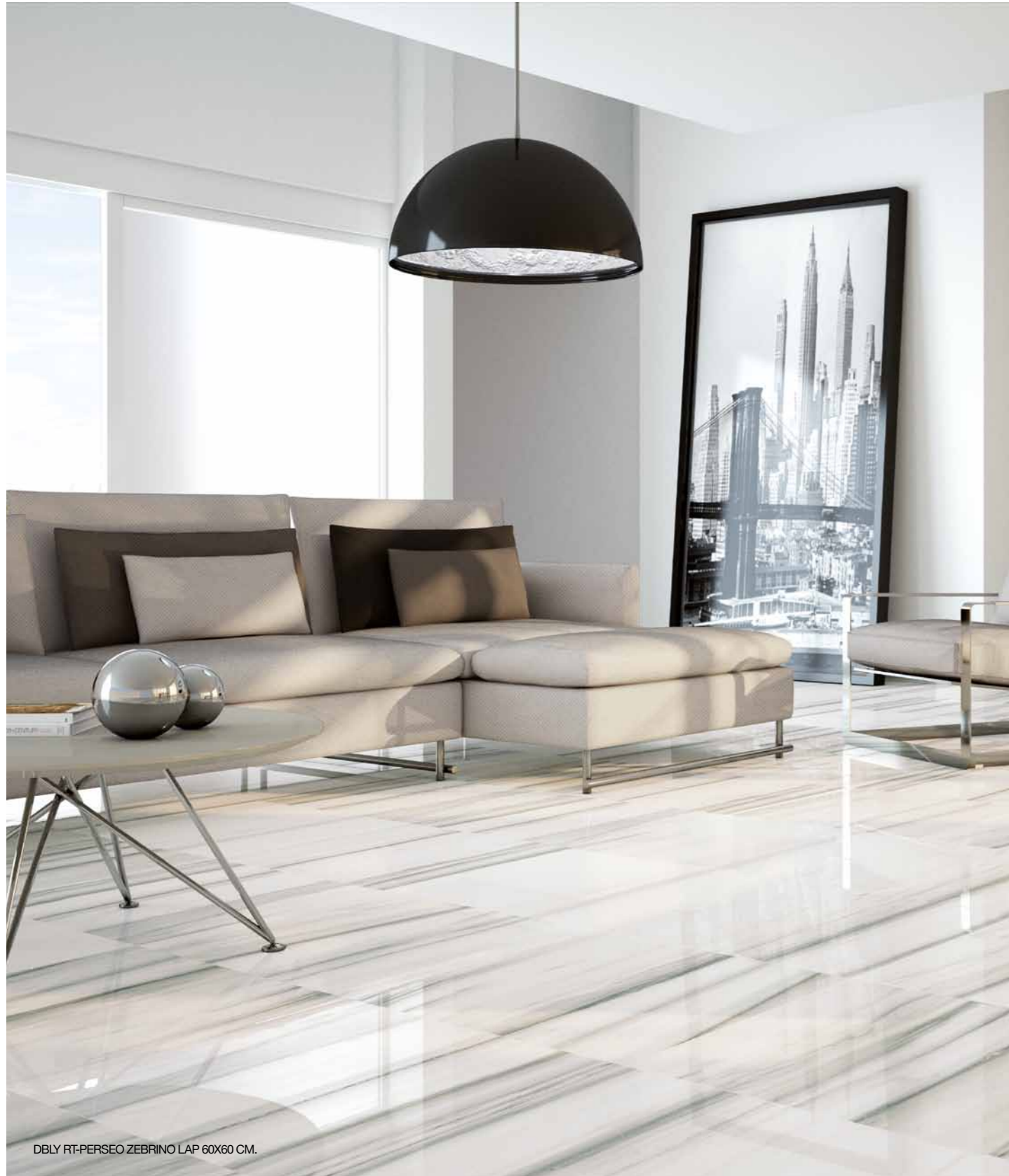
DBLY RT-PERSEO ZEBRINO LAP 60X60 CM.

Conforme/According to/Conforme Gemäß/Conforme/Соответствует Bla / UNE EN 14411 G