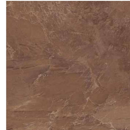
DBME Rt-Perseo Brown Lap 60x60 cm.