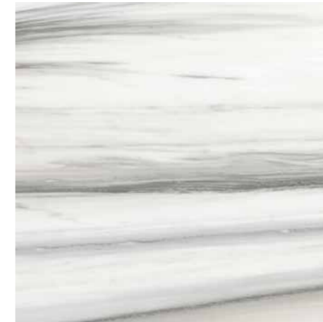
DBLY Rt-Perseo Zebrino Lap 60x60 cm.