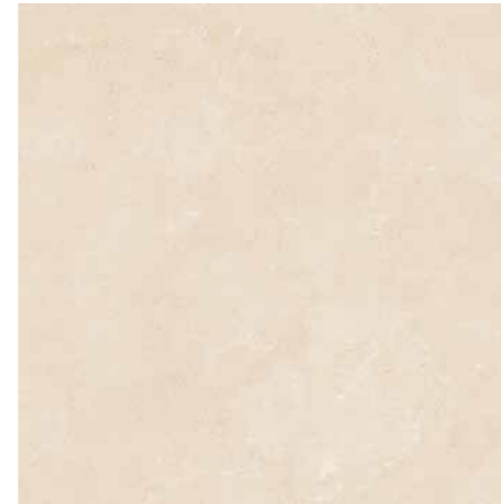
DBLZ Rt-Perseo Marfil Lap 60x60 cm.